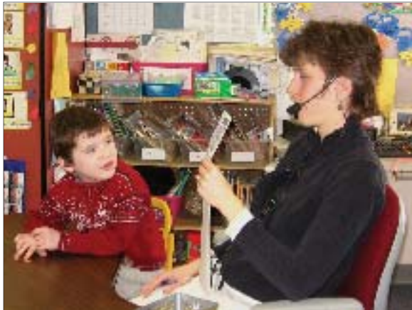
Public school student working with his teacher

PSO provides free statewide consultation services to parents and to professionals serving students who are deaf and hard of hearing.