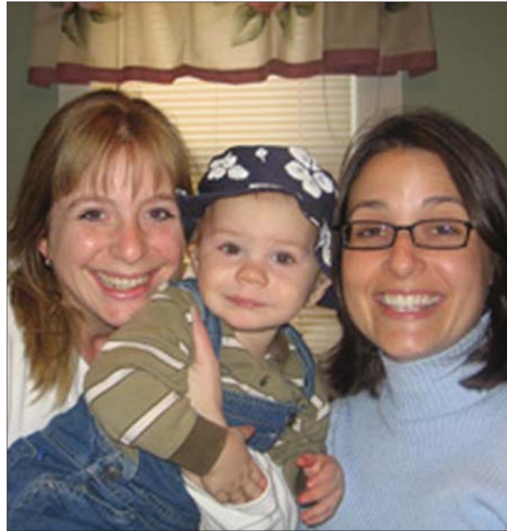
Home observation visit.

children and assist them with identifying the resources that will help them meet the individual needs of their infant or young child.