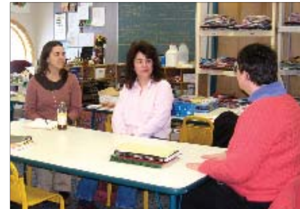
Observation summary meeting with parent and public school personnel.