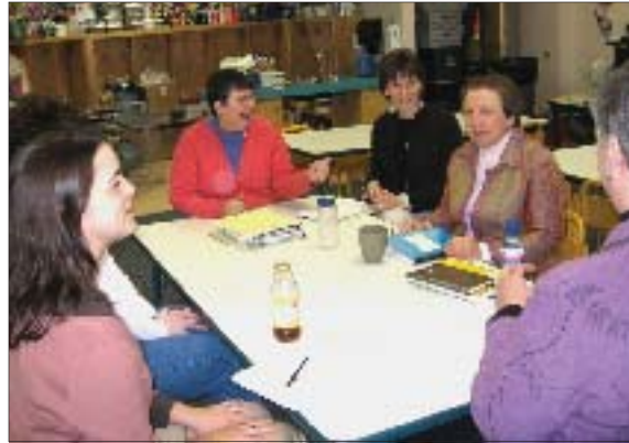
Outreach consultation with school staff

Our goal is to assist public school personnel in implementing a positive, appropriate educational experience for students who are deaf or hard of hearing which addresses the unique and individual needs of each student.