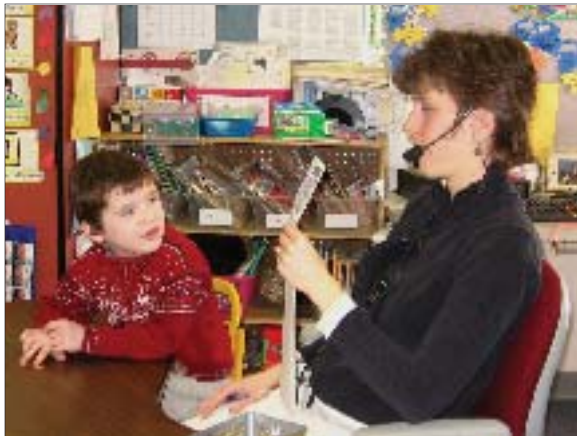
Public school student working with his teacher

PSO provides free statewide consultation services to parents and to professionals serving students who are deaf and hard of hearing.